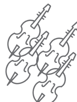
Vc 0 original 6