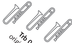
Trb 0 original 3