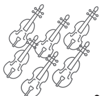
VI I 0 original 9