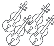
Va 0 original 7