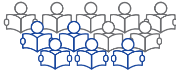
Coro 32 original 80

Bearbeitung für Bläserquintett – Besetzung Arrangement for wind quintet – scoring (Carus 40.653/50)